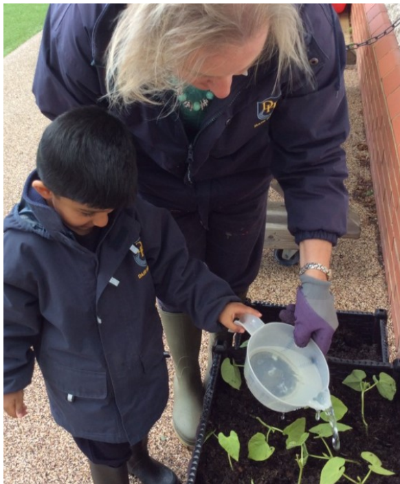
Nursery planting vegetables!