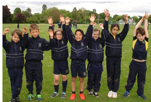
Y4 Cricket V Long Close (Away)