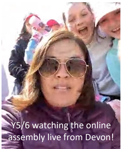
Y5/6 watching the online assembly live from Devon!