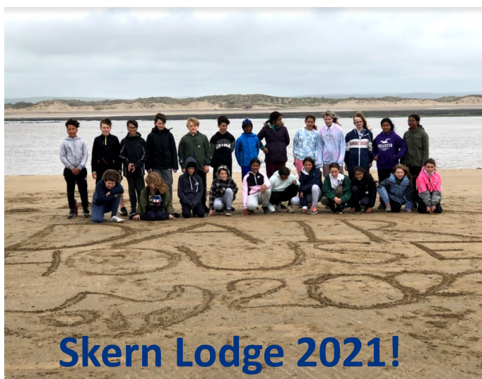
Skern Lodge 2021!